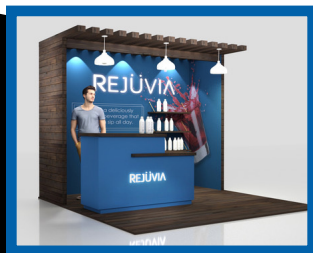
10x10' EXHIBIT System booth with custom wood simulation components and SEG graphics.