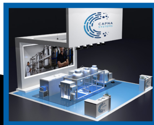
20x30' EXHIBIT Combination of system and traditional wood structure ceilings.