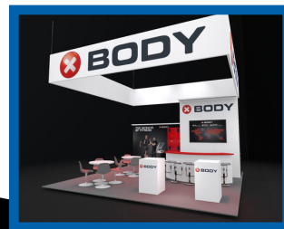
20x20' EXHIBIT Large hanging sign, custom bar, dressing rooms and custom product displays.