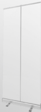
850mm Mosquito 850 (33.5" w x 78.5" h)

$199.00 KIT WITH BLANK SHIELD $240.00 KIT WITH PRINTED SHIELD