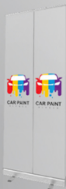
800mm Mosquito 800 (31.5" w x 78.5" h)

$112.00 KIT WITH BLANK SHIELD $135.00 KIT WITH PRINTED SHIELD