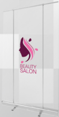
1200mm Mosquito 1200 (47.25" w x 78.5" h)

Retractable protective screens provide a safety barrier where and when you need it. Their portability and light weight makes screen placement a snap. They are available in several widths and heights. Contact us for your requirements!