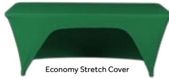
Economy Stretch Cover rear view